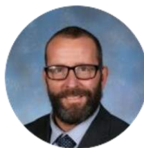
Head of College