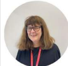
KS3 Lead & SEND